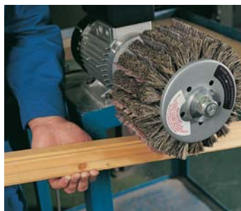
Model 8P4 used on wood moulding.