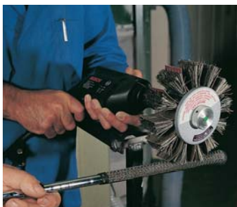
Model 6P1 used on rubber golf club handle.

Sanderheads are available in three sizes with various cutting widths of abrasive. The 8P models are normally driven by a bench or floor type spindle stand whilst the lightweight 6P1 and 6P2 models can be used with hand held portable and flexible power tools. The Sanderhead is constructed as a quality product and all parts which are subject to abrasive wear can easily be replaced.