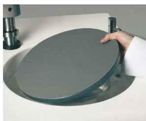
Simple exchange of working discs