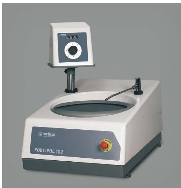
FORCIPOL 102 with Control Unit

The stylish and functional housing is corrosion free and easy to clean. Molded wheel bowls and drains eliminate leaks and the build-up of residue is prevented by constant flushing of the bowl. The drive elements are fixed on heavy duty aluminium alloy casting. The wheels are mounted on ball bearings allowing the application of high pressures to prepare even large specimens. Ball bearings used provide quite and vibration free operation. Water inlet and flexible water outlets with control valves for wet grinding are standard features. FORCIPOL instruments can be used for grinding, lapping and polishing with magnetic backed discs and cloths or by quick and simple exchange of wheels.