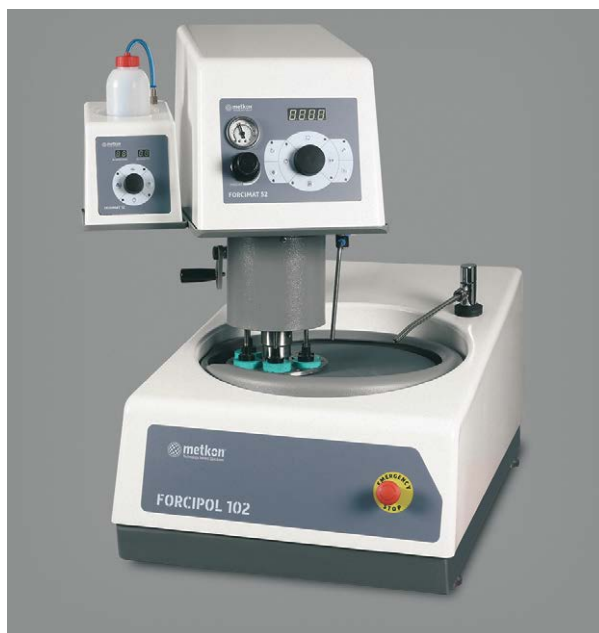
FORCIPOL 102 with Forcimat 52

Automatic Disc Cleaning & Drying function can be activated with a single button to obtain perfectly cleaned disc surfaces in seconds. Smart Water Saving feature allows tons of water saving over the years.