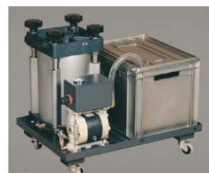
Enviro recirculating filtering unit (1 micron)