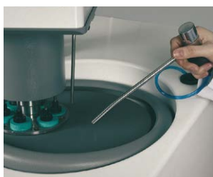
Retractable water hose for easy cleaning

Enviro Filter Unit is a closed loop recirculating filter system which is optionally available. It has a 20 lts. reservoir capacity with 1 micron filter entering the grinder / polisher intake. Enviro can also be coupled with line water and 80 micron filtering system for disposal.