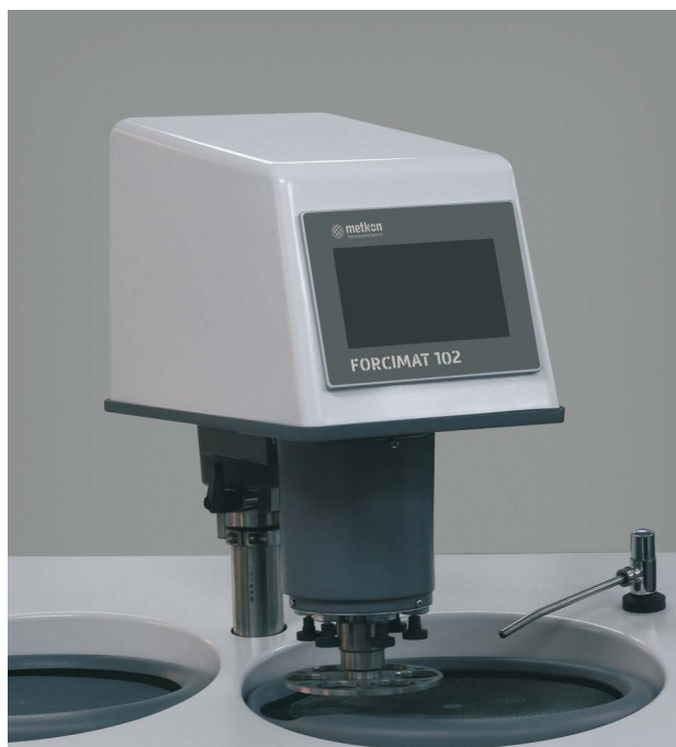
FORCIMAT 102 Programmable Automatic Head

Optional encoder allows you to measure the amount of material removed from the surface. The desired grinding depth can be set to grind different type of samples and also for applications that need special accuracy.