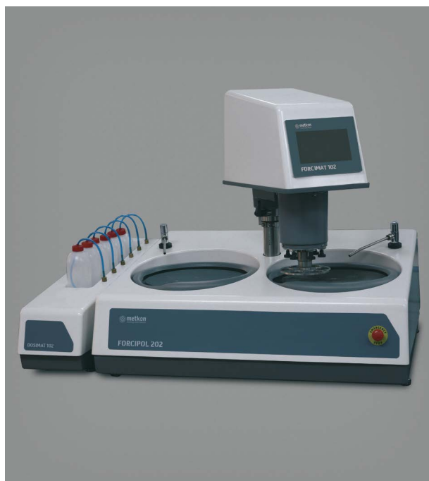
FORCIPOL 202 with FORCIMAT 102 & DOSIMAT 102

The "soft start and stop" feature automatically starts the sequence with a low initial force which is then increased to the preset. Towards the end of the cycle, the force is automatically reduced to 75 % of the setting to prevent scratching. A variety of sample holders for individual or central force applications are available for different sample sizes. Both individual and central force specimen holders can be removed and inserted easily with the help of quick release chuck. By holding the head button on the software, the specimen holder will rotate for easy insertion and removal of the specimens.