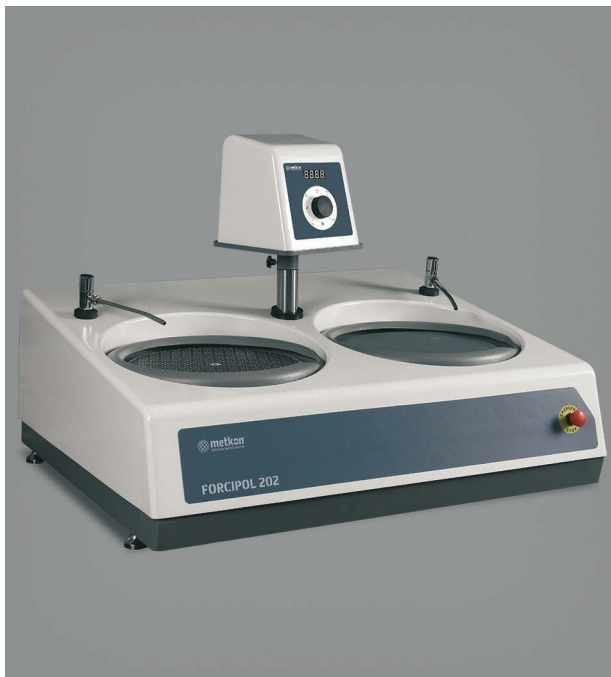
FORCIPOL 202 with Control Unit