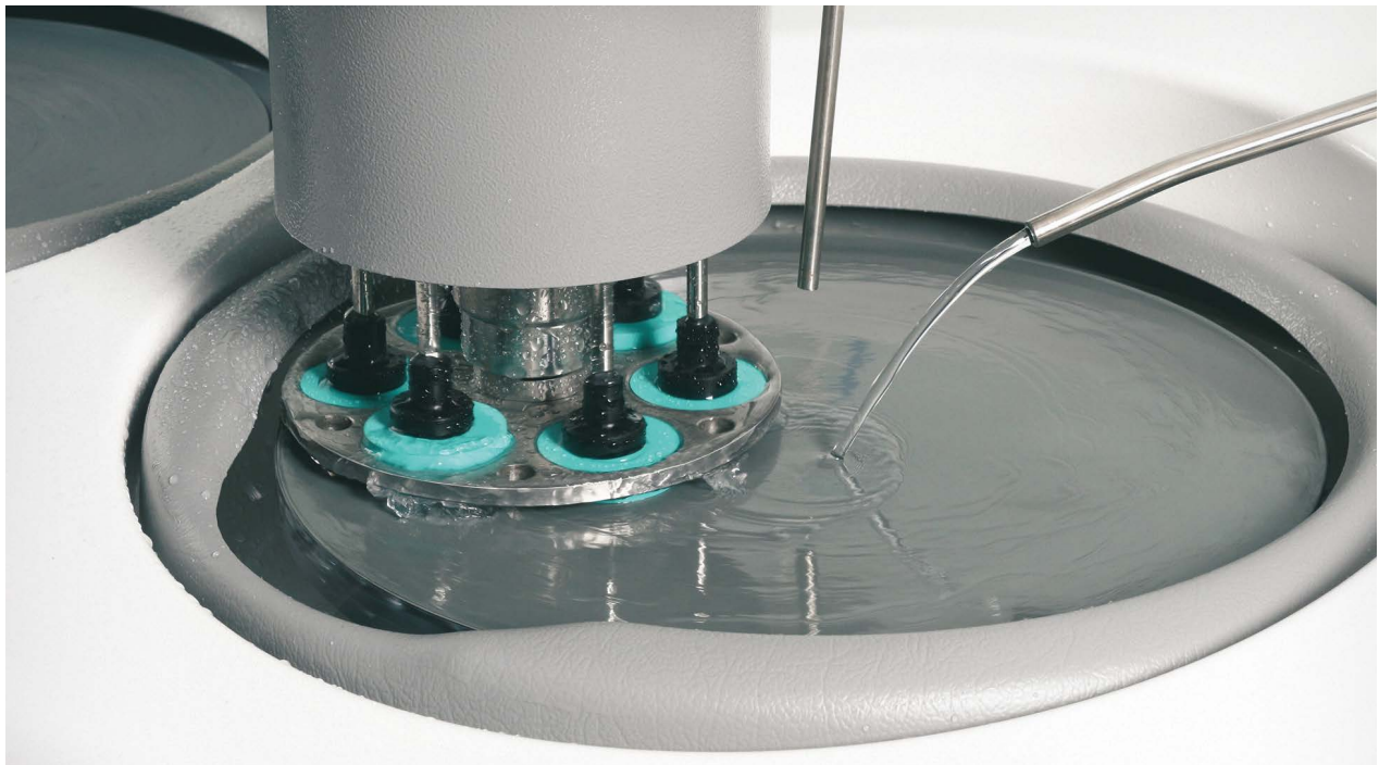
Automatic Water Flow

DOSIMAT 102: Programmable with 6 Peristaltic Pump for FORCIMAT 102