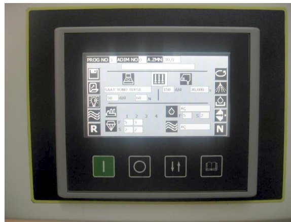
Programmable HMI touch screen